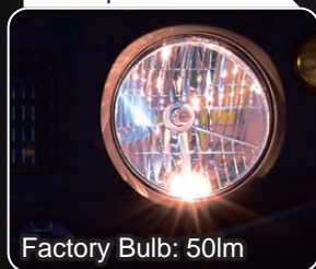
Factory Bulb: 50lm