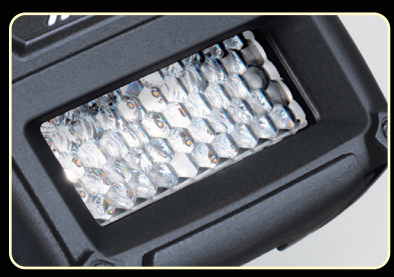
Newly designed diffusing lens and reflector delivers evenly distributed illumination.